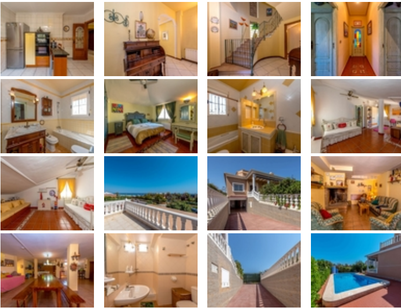
LUXURY VILLA IN PRIVATE AREA. SECOND LINE BEACH~PLOT 800 M2 WITH POOL, GARAJE, PERGOLA AND GARDEN.~PROPERTY 450 M2~6 BETHROOMS AND 5 BATHS PROPERTY ~FULLY FURNISHED~~